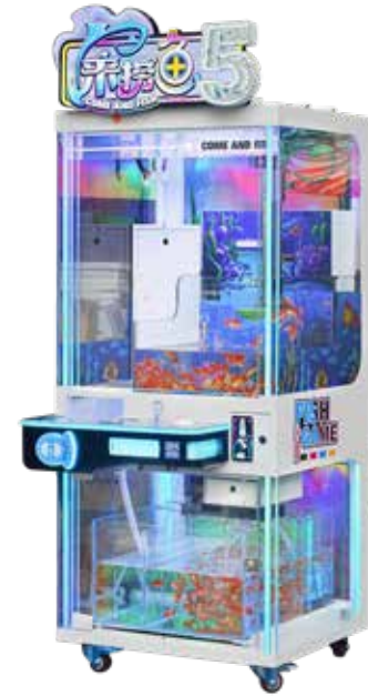
Size: L720*W810*L1940mm Power: 170W