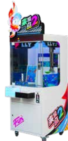
Size: L720*W780*L2200mm Power: 100W