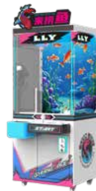
Size: L620*W685*L1740mm Power: 100W